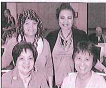
Some enthusiastic homeowners dressed in style for the occasion.

New Website! Our web portal will be temporarily unavailable at the end of May. We are in the process of creating a NEW website for our homeowners. You told us what you wanted, and we listened! You will be able to: share recipes; register (and pay!) for classes and activities; sign up for clubs and groups; reserve courts and sports equipment; access archived Board minutes and newsletters, and much more.